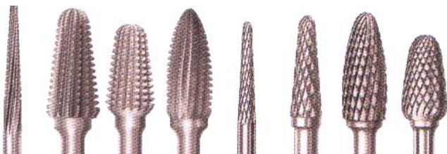
Above: Examples of cross-cut steel trimmers. Note the many different profiles available.

The drill is quite useless without some device fitted into the handpiece. Chosen intelligently with regard to its characteristic properties, it is this device (the bur), which will speed up our treatment and improve the comfort of the patient. It is this device that executes the work at the 'skinface'. The device may be a bur, a trimmer, an arbor band, cap, disc, umbrella, 'stone' or diamond. These tools are mostly produced for the dental trade and profession, from whom they are usually 'borrowed' by the foot health industry. A very wide range of handpiece bits are used in technical dentistry and in the dental surgery, and they are used in greater numbers and much more intensively than by the foot health professions. Only a very few designs are produced specifically for the podiatrist/foot health practitioner. The devices listed work either by 'cutting' or 'abrasion'. Burs and trimmers cut ; stones, arbour bands, caps and diamonds abrade .