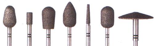
Below: Examples of industrial diamond chip encrusted profiles (diamonds). On the extreme right is an 'umbrella' that is coated only on the upper surface of the canopy.