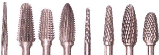
Above: Examples of cross-cut steel trimmers. Note the many different profiles available. These same shapes are now available as 'ceramic' burs – they cut very smoothly yet generate less heat as they work

The drill is quite useless without some device fitted into the handpiece. Chosen intelligently with regard to its characteristic properties, it is this device (the bur), which will speed up our treatment and improve the comfort of the patient. It is this device that executes the work at the 'skinface'. The device may be a bur, a trimmer, an arbor band, cap, disc, umbrella, 'stone', or diamond. These tools are mostly produced for the dental trade and profession, from whom they are usually 'borrowed' by the foot health industry. A very wide range of handpiece bits are used in technical dentistry and in the dental surgery, and they are used in greater numbers and much more intensively than by the foot health professions. Only a very few designs are produced specifically for the podiatrist/foot health practitioner. The devices listed work either by 'cutting' or 'abrasion'. Burs and trimmers cut ; stones, arbour bands, caps and diamonds abrade .