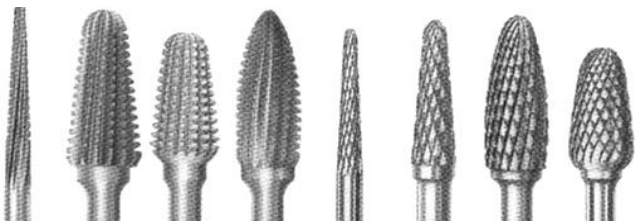
Above: Examples of cross-cut steel trimmers. Note the many different profiles available.

The drill is quite useless without some device fitted into the handpiece. Chosen intelligently with regard to its characteristic properties, it is this device (the bur), which will speed up our treatment and improve the comfort of the patient. It is this device that executes the work at the 'skinface'. The device may be a bur, a trimmer, an arbor band, cap, disc, umbrella, 'stone' or diamond. These tools are mostly produced for the dental trade and profession, from whom they are usually 'borrowed' by the foot health industry. A very wide range of handpiece bits are used in technical dentistry and in the dental surgery, and they are used in greater numbers and much more intensively than by the foot health professions. Only a very few designs are produced specifically for the podiatrist/foot health practitioner. The devices listed work either by 'cutting' or 'abrasion'. Burs and trimmers cut ; stones, arbour bands, caps and diamonds abrade .